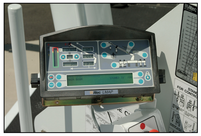
Altec LMAP System