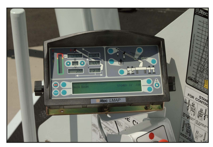
Altec LMAP System