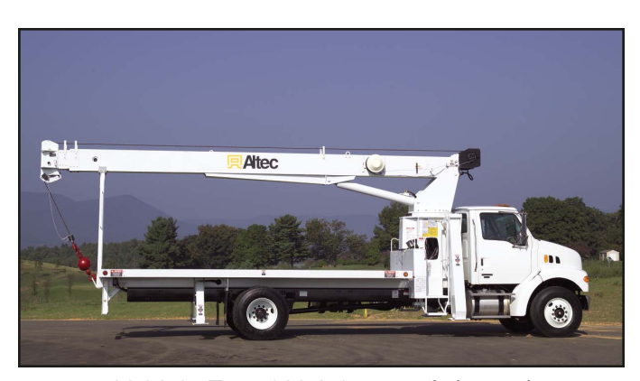
Vehicle Travel Height 12.8 ft (3.9 m)

Ontario Service Center 831 Nipissing Road Milton, Ontario L9T 4Z4