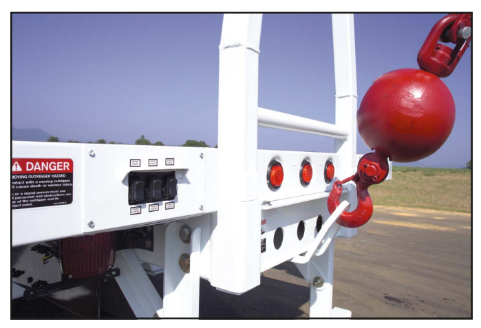
Easy Load Block Stowing