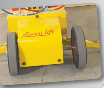
The lift has a side extension to the last correction of the plasterboards before installation.