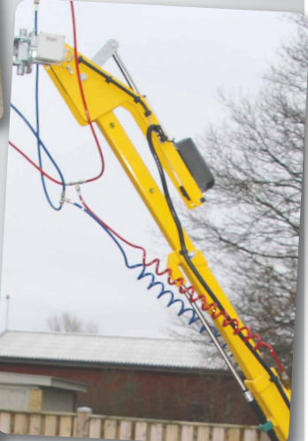
The beam has a manual extension in addition to the electrical.