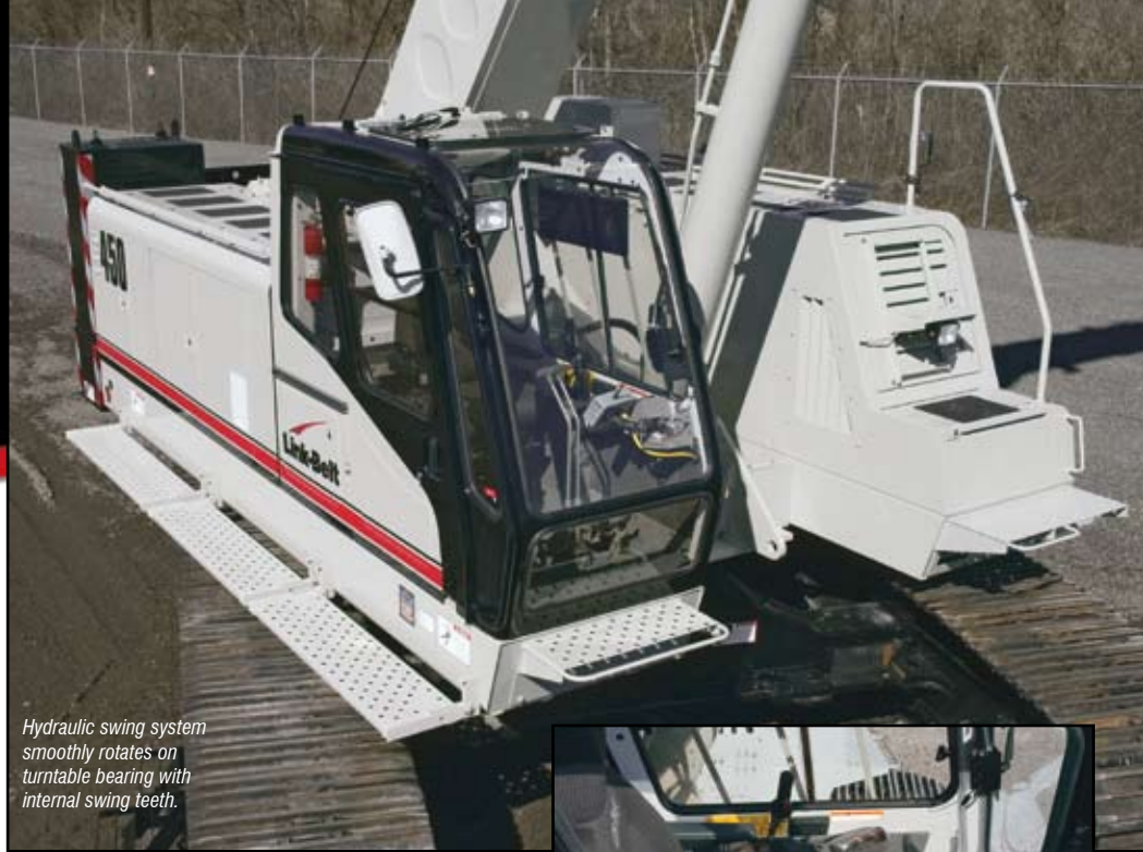
Hydraulic swing system smoothly rotates on turntable bearing with internal swing teeth.