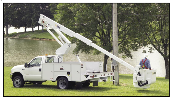
Easy Access From Ground

Altec Aerial Devices meet or exceed all applicable ANSI Standards as of the date of manufacture. Altec reserves the right to improve models and change specifications without notice or obligation.