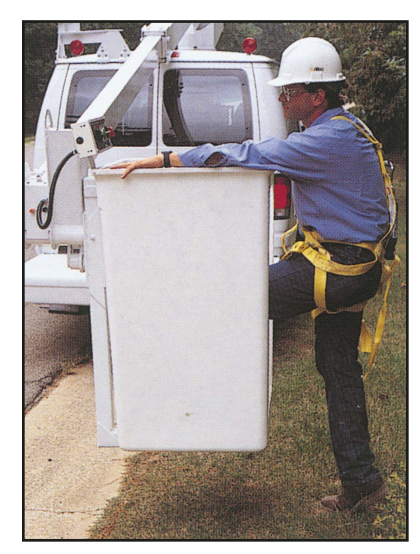
Easy Platform Access from the Ground

Altec Aerial Devices meet or exceed all applicable ANSI Standards as of the date of manufacture. Altec reserves the right to improve models and change specifications without notice or obligation.