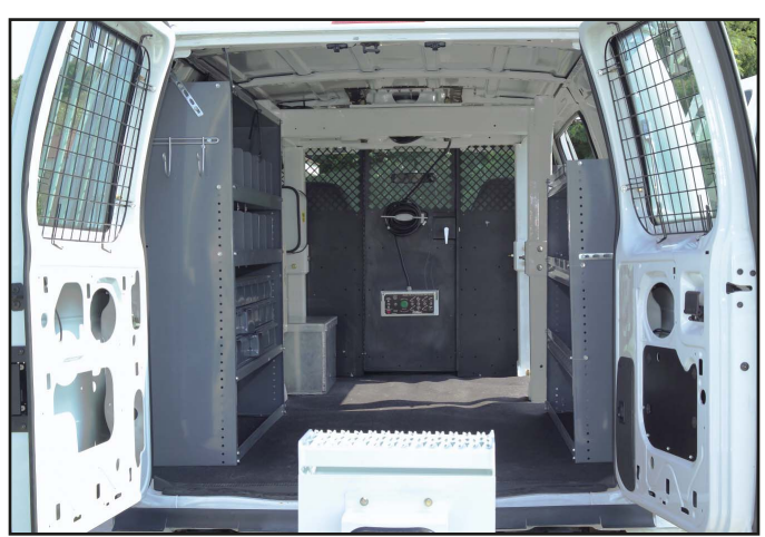
Optional Bridgemount Pedestal