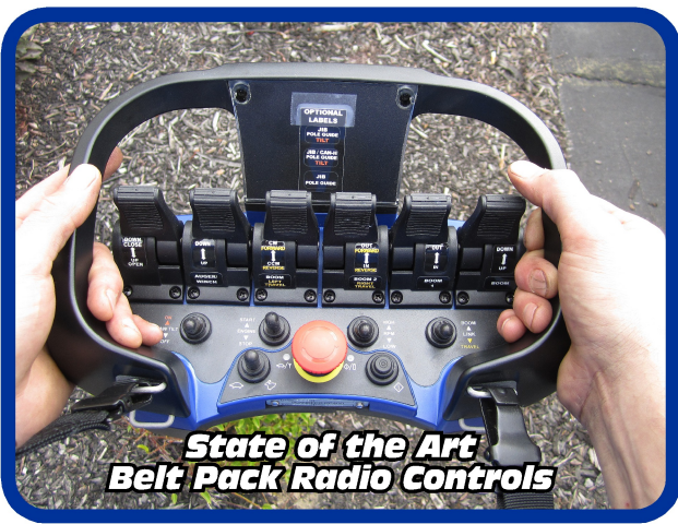
State of the Art Belt Pack Radio Controls