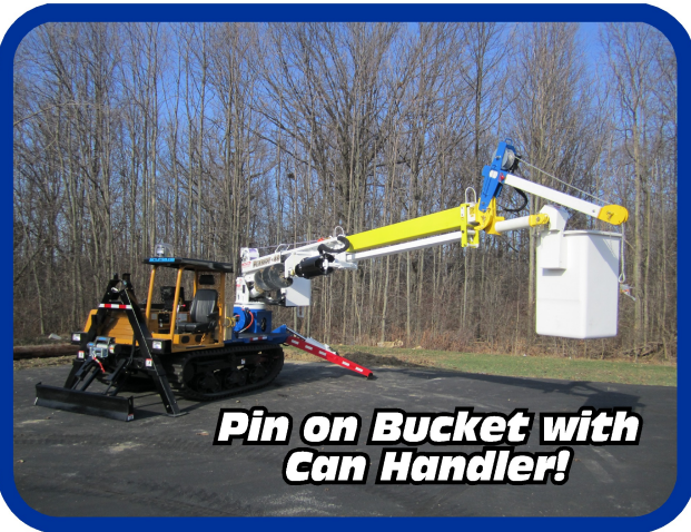
Pin on Bucket with Can Handler!