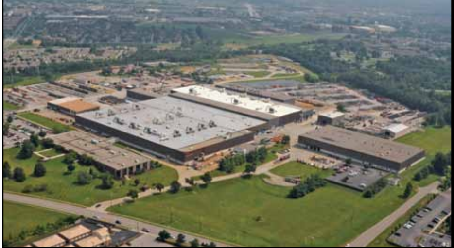
Link-Belt headquarters - Lexington, Kentucky