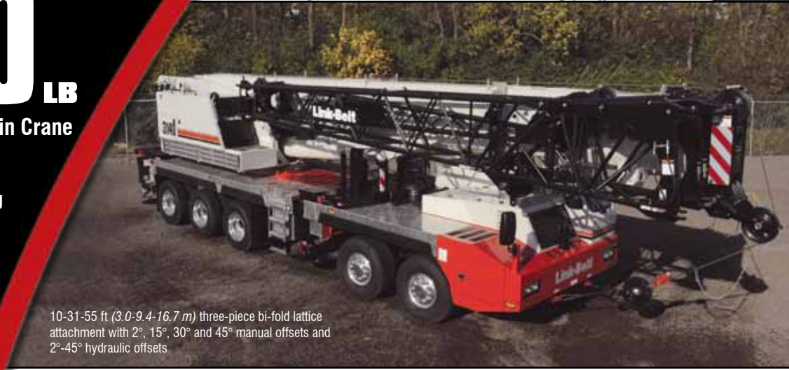
10-31-55 ft (3.0-9.4-16.7 m) three-piece bi-fold lattice attachment with 2°, 15°, 30° and 45° manual offsets and 2°-45° hydraulic offsets