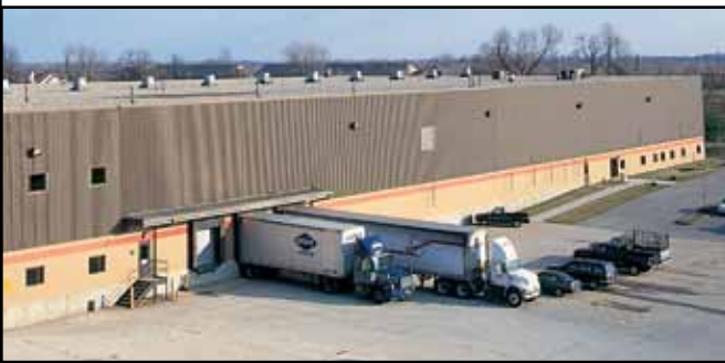
Link-Belt Parts Distribution Center