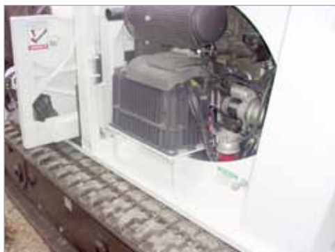
2,000 watt Inverter