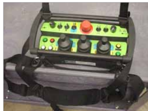
New style radio remote