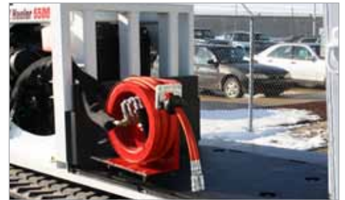
Hose reel available

Warning: Do not use in conjunction with main crane winch. Serious injury or death can occur