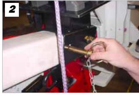
2 Secure jib with pin