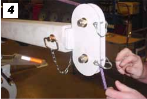
4 Secure rope around pulleys