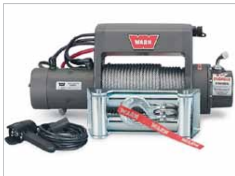
Recovery winch available