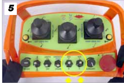
5 Use accessory toggle switches on the remote control to operate the material handler