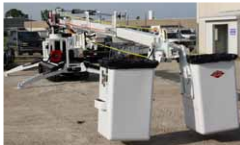
Buckets can be mounted on either side