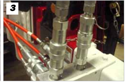
3 Attach quick couplers