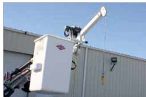
1,000lbs winch tip material handling