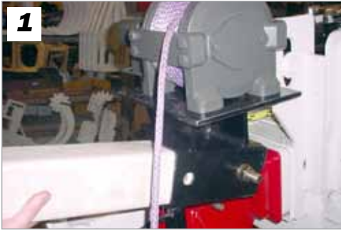
1 Attach jib