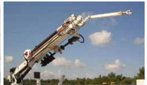
Phase adapter available

Contact Your Representative for More Information