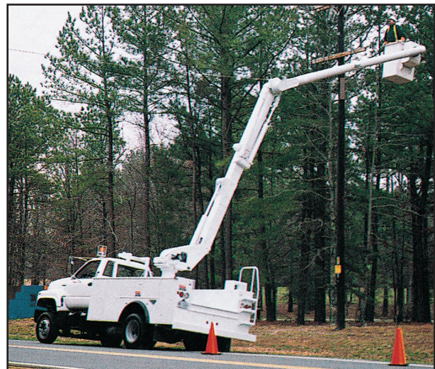
Superior Working Reach with No Outriggers

Altec Aerial Devices meet or exceed all applicable ANSI Standards as of the date of manufacture. Altec reserves the right to improve models and change specifications without notice or obligation.