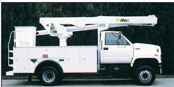
Side-by-Side Booms for Low Travel Height

*Based on 40 in (1016 mm) Chassis Frame Height