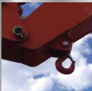
Boom Lift Point