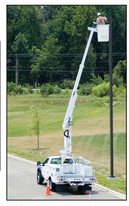
Exceptional Vertical Reach