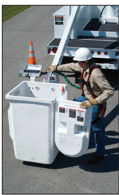
Easy Ground Access to the Platform