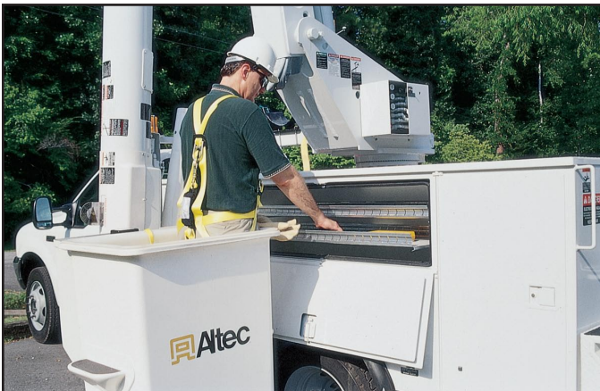
Altec L37M offers easy body compartment access from the platform.

Altec Aerial Devices meet or exceed all applicable ANSI Standards as of the date of manufacture. Altec reserves the right to improve models and change specifications without notice or obligation.