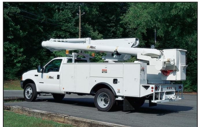
Low stow feature, low center of gravity and low travel height offers operator easy platform access, a stable driving unit and the ability to maneuver in low overhead areas.