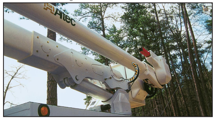
Automatic upper boom stow system reduces setup and stow times

Altec Aerial Devices meet or exceed all applicable ANSI Standards as of the date of manufacture. Altec reserves the right to improve models and change specifications without notice or obligation