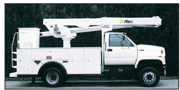
Side-by-Side Booms for Low Travel Height