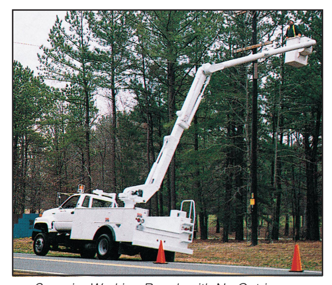
Superior Working Reach with No Outriggers