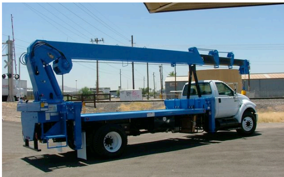
Rear Mount or Behind the Cab Mount