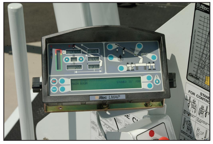
Altec LMAP System